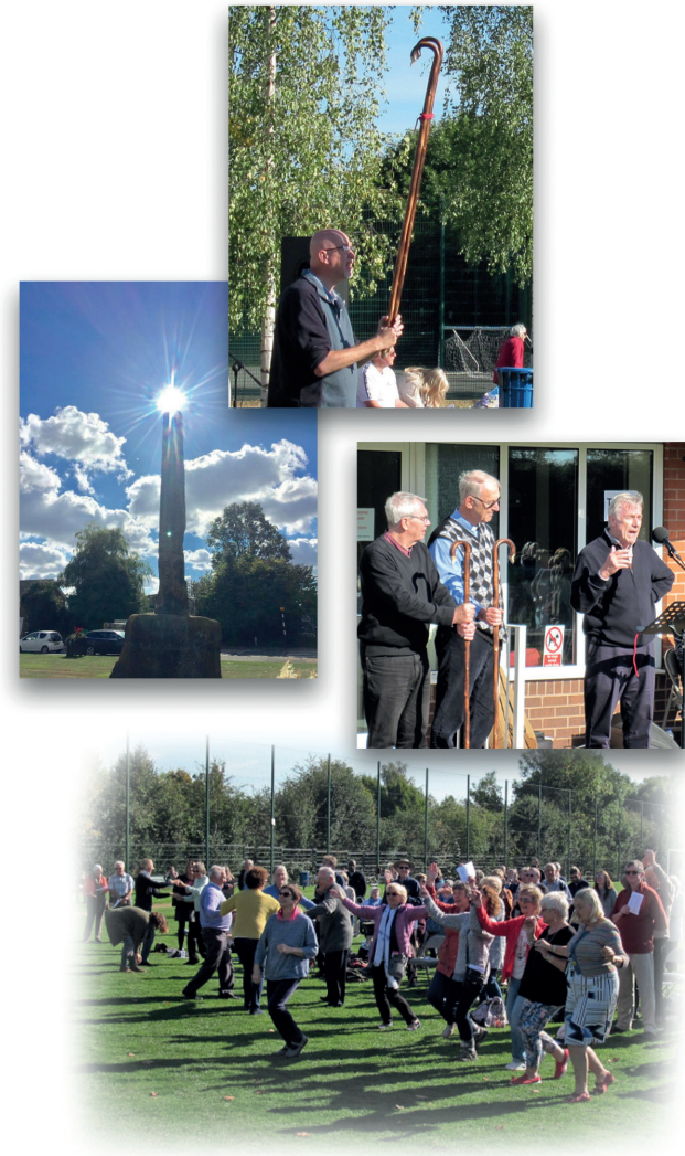
Photos from the 'As One' gathering, at Coventry then at Meriden. Top left: The burst of sunlight on the Meriden Cross