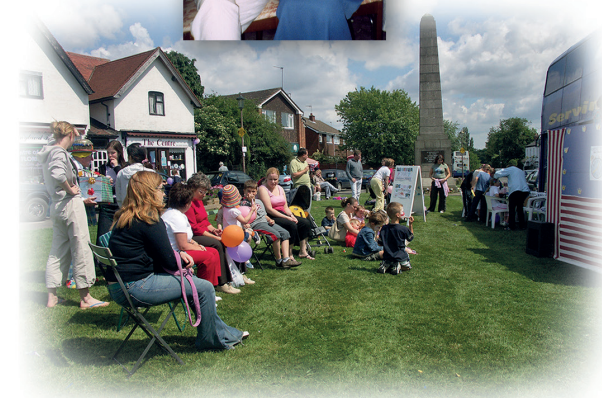
The Centre with some of our friends; Meriden Green during an Outreach, supported by Birmingham City Mission.