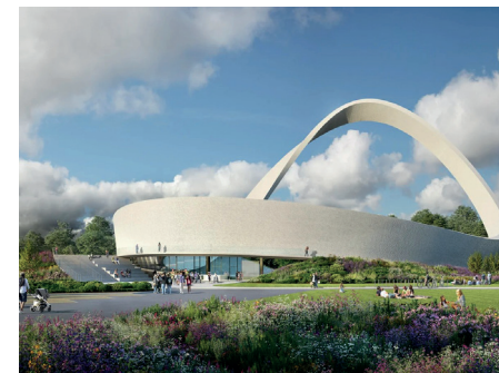
Eternal Wall of Answered Prayer